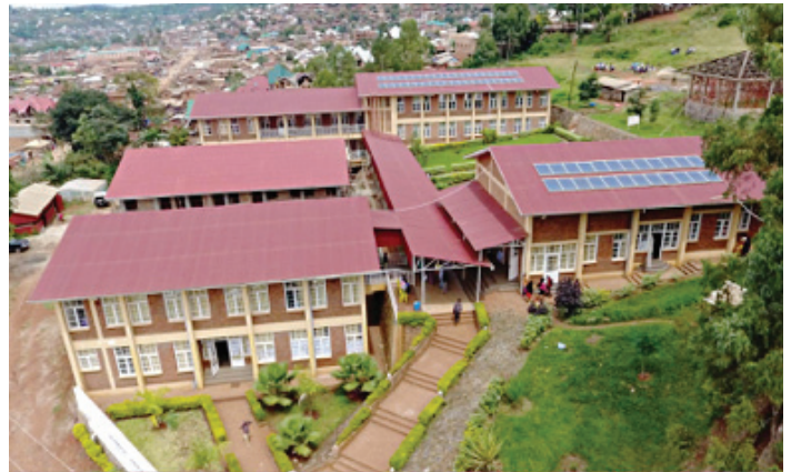
The School of Agronomy on the beautiful UEA campus in Bukavu

As a way of exploring potential partnership, Education Congo has offered an initial scholarship fund, and requested project proposals from UEA that Education Congo may support over the next 5 years. UEA leadership responded with four detailed proposals that focus on key issues facing the region and on preparing students to address them. These proposals include projects in medical practice, healing from psychological trauma, peace and reconciliation, and English language acquisition. Education Congo is currently evaluating these proposals and hopes to share in coming issues of Communiqué how you may participate with us in supporting these projects that are so critical to the Kivu region and to the Congo at large.