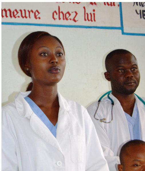
Medical intern presenting a case to her peers and supervisor

The condition of DRC's roads and UPC's limited financial resources created major challenges to implementing this strategy, particularly in transporting the interns and their supervising faculty to two of the three training sites. The University had been using a donated vehicle for this purpose. Due to heavy use and the poor condition of the roads, the vehicle suffered a serious accident and was beyond repair. The University was faced with the difficult problem of getting the students and preceptors to their assigned locations. This put in jeopardy the completion of the students' clinical training and subsequent graduation.